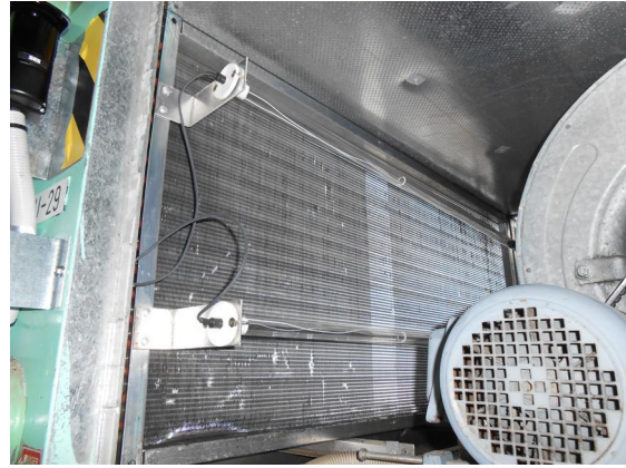
HVAC Air Handling Unit after UVC installation