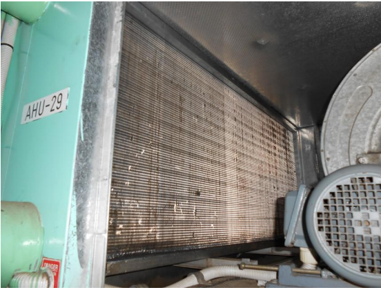
HVAC Air Handling Unit before UVC installation

After just 3 months of operation, CAD units delivered a minimum of 20 % improvement in airflow, heat transfer and energy savings. Furthermore, IAQ (Indoor Air Quality) improved dramatically and eliminated manual duct and coil cleaning. The CAD lamps provide a very high UVC output and are maintenance free. Beyond Energy Solutions provided an innovative UV solution with a short return on investment - with multiple benefits for their client.