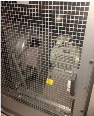
Pump of the ventilation system - has to stay clean

After 4 months of operation, Jacobs Bond is very pleased. There were no complaints from the Chinese restaurant about the installed system and the filter lifetime was extended significantly according to Jacobs Bond who does the maintenance of the ventilation system. The effect of UV lamps from Heraeus Noblelight has once more positively convinced the customer. Now, Jacobs Bond is saving time and money as well as increasing the fire safety in their ventilation system. They are interested in getting additional UV systems for similar cases, since other restaurants in the building are considering the retrofitting of the Kitchen Control System for their hoods as well.