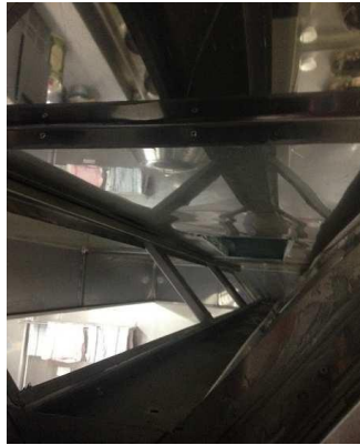
Inner view of the kitchen hood without UV system