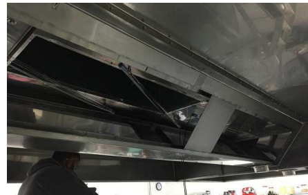
Inner view of the kitchen hood with UV system